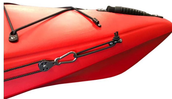
Example Installation at Kayak Bow