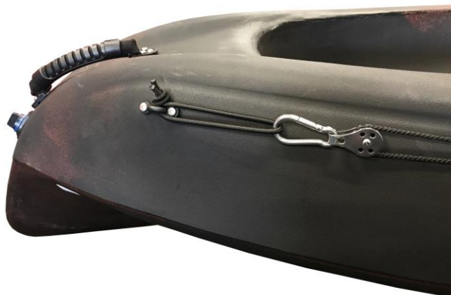
Example Installation at Kayak Stern

STEP 5: Feed your Anchor Trolley Line, from top to bottom, through the pulleys at each end. Using a bowline (or similar knot – Blood Knot, Scaffold Knot etc.), tie one end of rope to the karabiner. Now pull the two ends until they join in the centre of your kayak and tie the other end of the rope to the karabiner. NOTE: to ensure the trolley line maintains taut but not too tight you may need to disconnect one snap hook from pad eye before tying second knot.